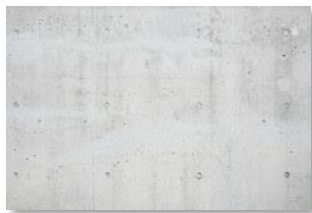
concrete & aerated concrete

Hilti CFS-BL Firestop Block is a pre-cured firestop block that is designed for use as a dust and fibre-free firestop seal. These ready-to-use blocks are ideal for creating an immediate firestop seal around cables, cable bundles and conduits with or without cable trays in large openings in walls and floors without the need for mineral wool to achieve an FRL of up to -/120/120. The blocks may be removed and cut to size when additional services need to be accommodated. No electric tools are necessary. Hilti CFS-BL Firestop Block may be used with various base materials such as: